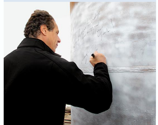
Governor Cuomo leaves his signature on one of the very first pilings on the New NY Bridge.

Formal construction began on Oct. 16 with the installation of permanent piles, which will constitute the foundation of the new bridge. Pile installation will continue for 12 – 18 months. The project is scheduled for completion in April 2018.